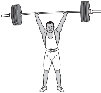
Fig. 6.1 shows a person carrying out an overhead press.

Classify this skill on the environmental influence continuum and the pacing continuum. Explain your answers.