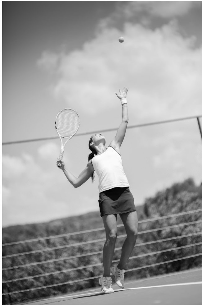
Figure 3 shows a tennis player performing a serve.

4 Skills can be classified using different continua.